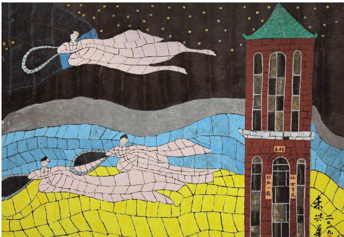
朱興華 Chu Hing Wah (b.1935) 《仙女下凡》 Mosaic of Fairies 2019 Ink and Color on Paper 66 x 96 cm