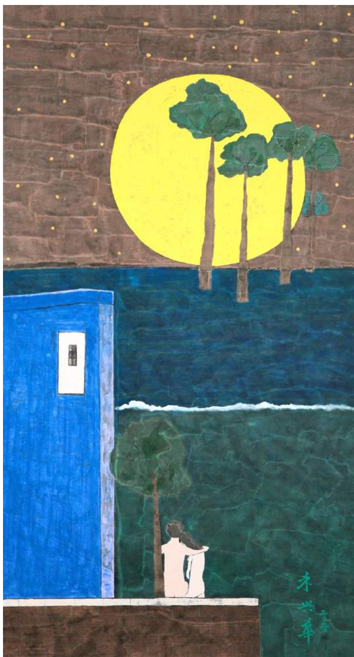
朱興華 Chu Hing Wah (b.1935) 《大月光愛侶》 Full Moon Lovers 2020 Ink and Color on Paper 175.5 x 96.5 cm

青年時期進入專科學院後，朱興華的繪畫生命與他專業心理科護士的生涯長年並行。他著眼心理的脆弱點以關心平民，以是他的人情味沒有市井氣，雖然取材不離香港人熟悉的片段。他的技巧帶著素人畫的稚氣，但懷著世故的淳厚。小市民生活之樂在於人情與天倫，這是抵禦商品化時代的底氣，也是親近世間事物的出發點。