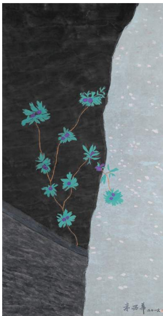
朱興華 Chu Hing Wah (b.1935) 《家花野花之二》 Cultivate Flowers, Wild Flowers II 2016 Ink and Color on Paper 134.5 x 70 cm