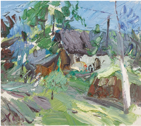
譔北新 CHEN Beixin 2008 油彩畫布 《荷葉印象》 Impression of Heye Town Oil on Canvas 32 x 36 cm