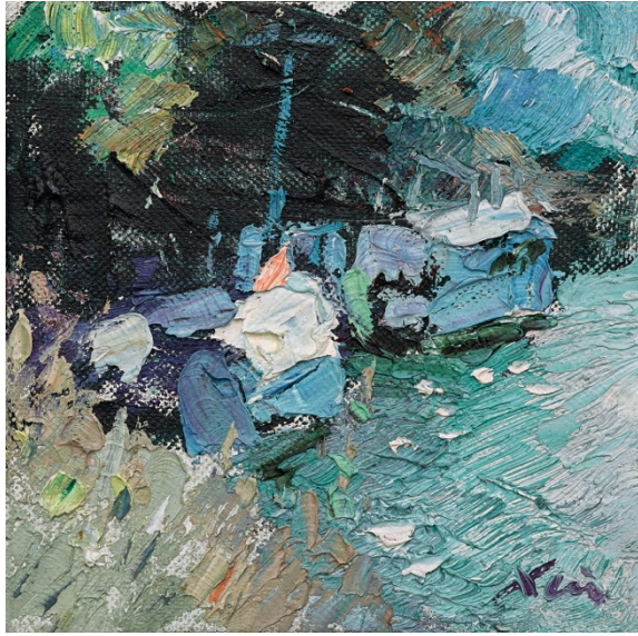
諶北新 《太浩湖》 CHEN Beixin Lake Tahoe 2006 油彩 畫布 Oil on Canvas 25 x 25 cm

諶北新個展《晨曦》訂於 2016 年 12 月 7 日（週三）晚上 6-8 時在畢打行漢雅軒開幕。展覽將展出藝術家從 2005 年到 2014 年創作超過 30 幅的油畫作品。