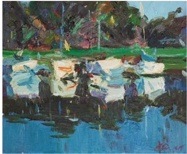
譔北新 CHEN Beixin 2009 油彩畫布 《白船》 White Boats Oil on Canvas 51 x 61 cm