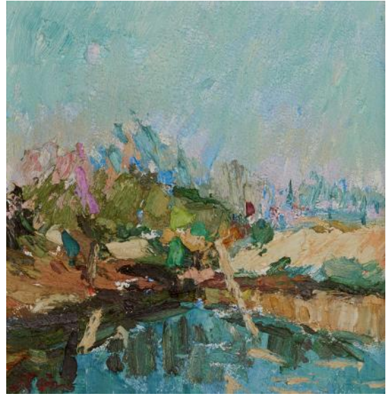
諶北新 《爭春》 CHEN Beixin Riotous Spring 2011 油彩 畫布 Oil on Canvas 22 x 21 cm