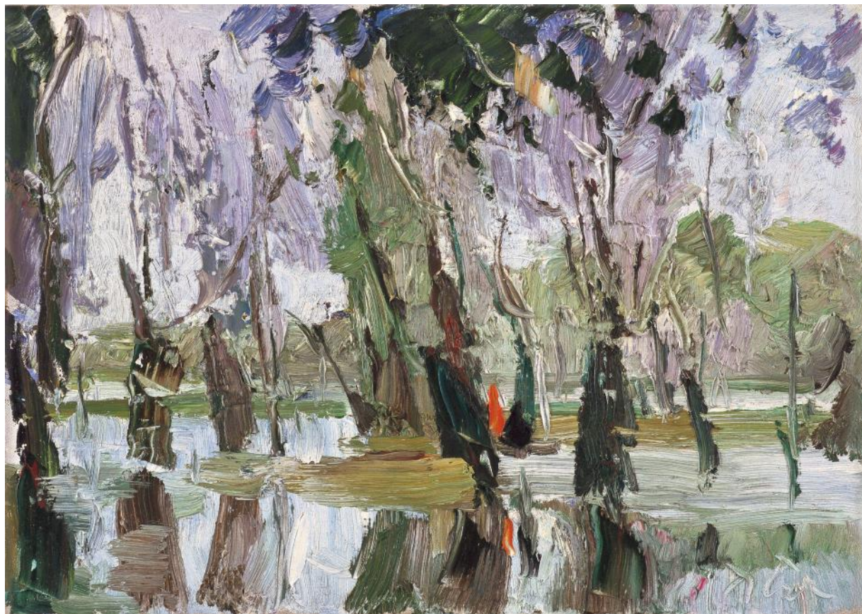
譔北新 《微風》 CHEN Beixin Zephyr 2010 油彩 畫布 Oil on Canvas 80 x 100 cm

展期 2016年12月7日至2017年1月7日 Exhibition Period 7 December 2016 – 7 January 2017