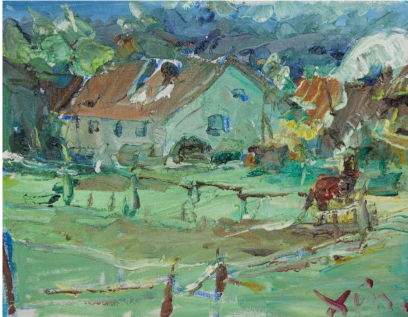
陳北新 《馬棚人家》 CHEN Beixin Ranch House 2013 油彩 畫布 Oil on Canvas 35 x 45 cm

The opening reception of Expressionist oil painting master Chen Beixin's solo exhibition Light of Day will take place on Wednesday, 7 December 2016, from 6-8pm, at Hanart TZ Gallery. The exhibition will feature more than 30 oil paintings created from 2005 to 2014.